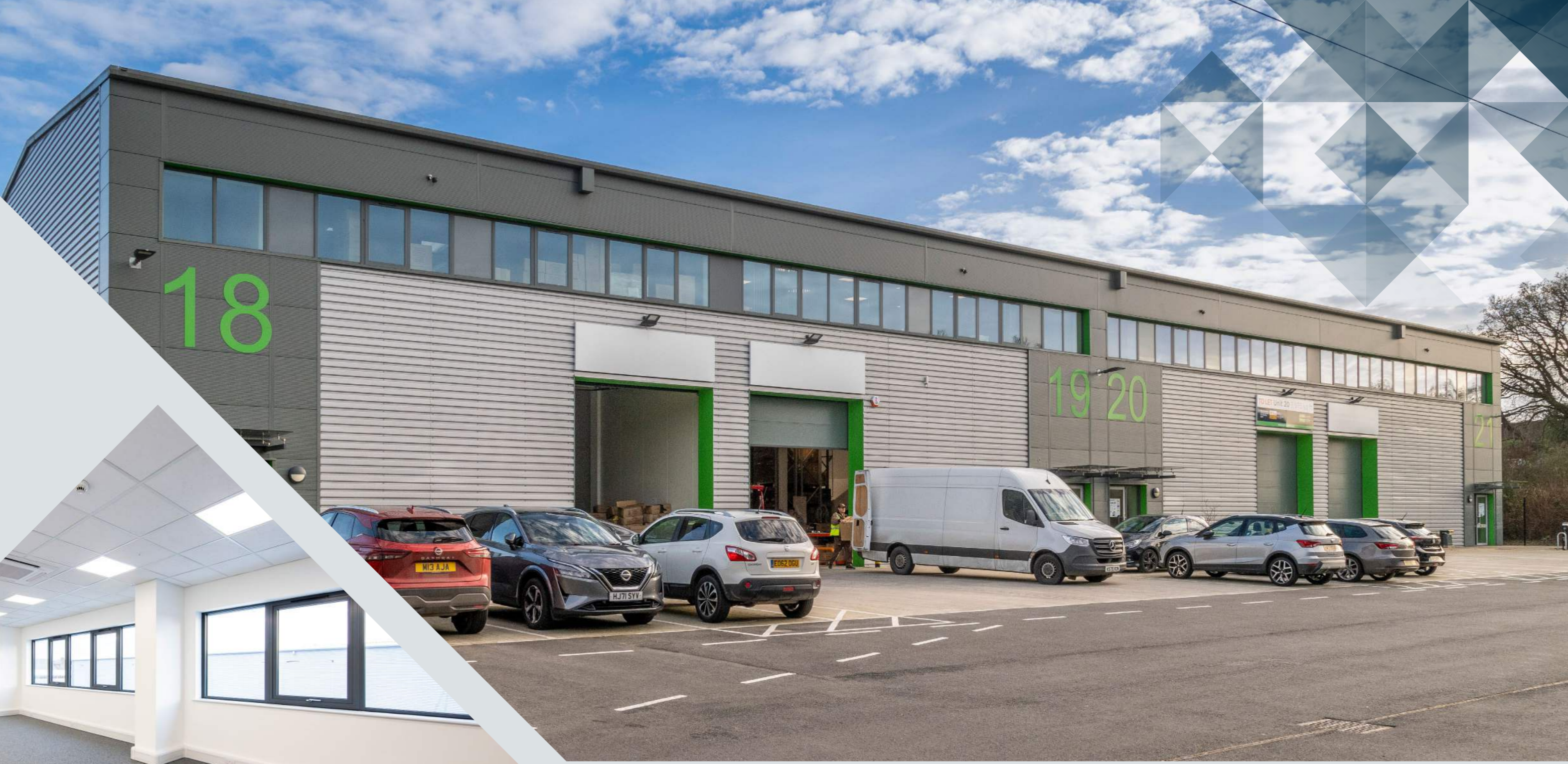
Indicative image from similar development

Units are available to lease on terms to be agreed.